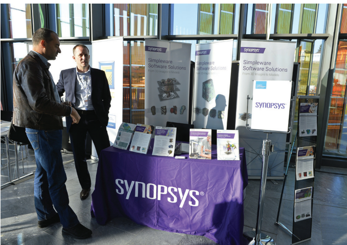
2023 Expected Attendees

Audience: Researchers, scientists, physicists, and engineers from commercial, government, and academic organizations.